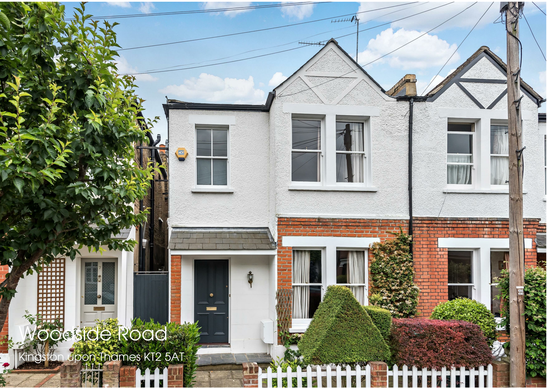
Woodside Road Kingston upon Thames KT2 5AT